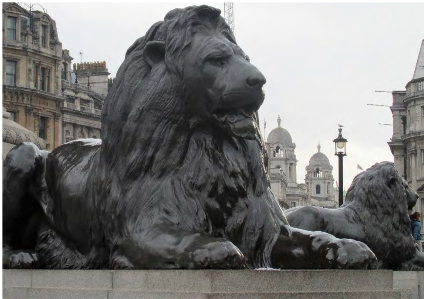
One of the four “Landseer Lions”