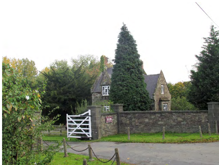
Lodge at Snell's Nook