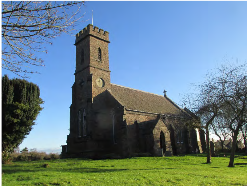
St Philip and St James, Groby