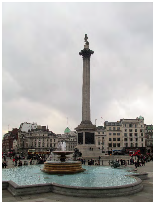
Nelson's Column, Trafalgar Square