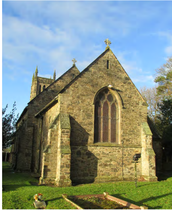
St Peter Church, Copt Oak