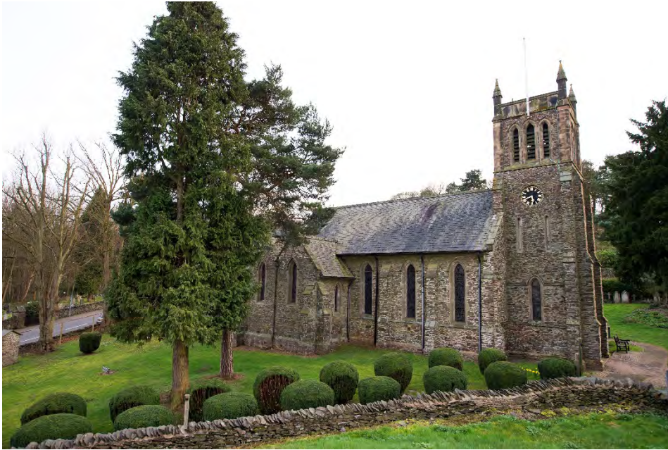
St Paul's Church, Woodhouse Eaves