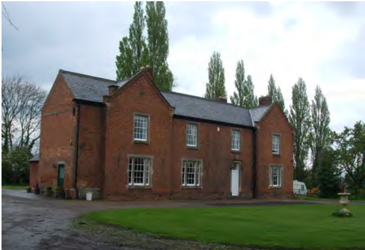
Dishley Grange