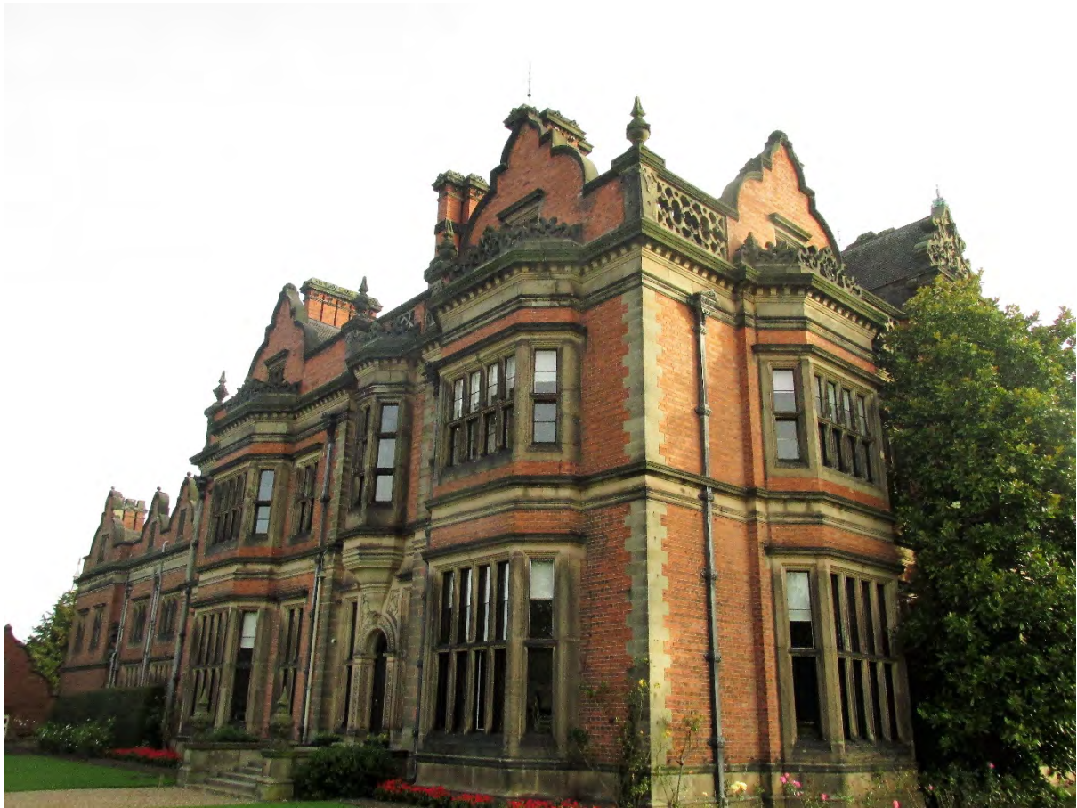
Beamanor Hall

the show-piece stairway. Railton exhibited at the Royal Academy between 1829 and 1851 (a year after he had ceased to be an architect).